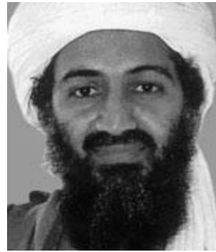
USAMA BIN LADEN

There are approximately 3,000 names on the list.